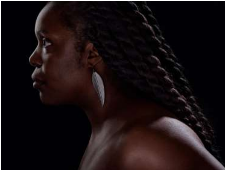
"Abigail Ekue, Photographer", Mandatory Credit: Bill Wadman