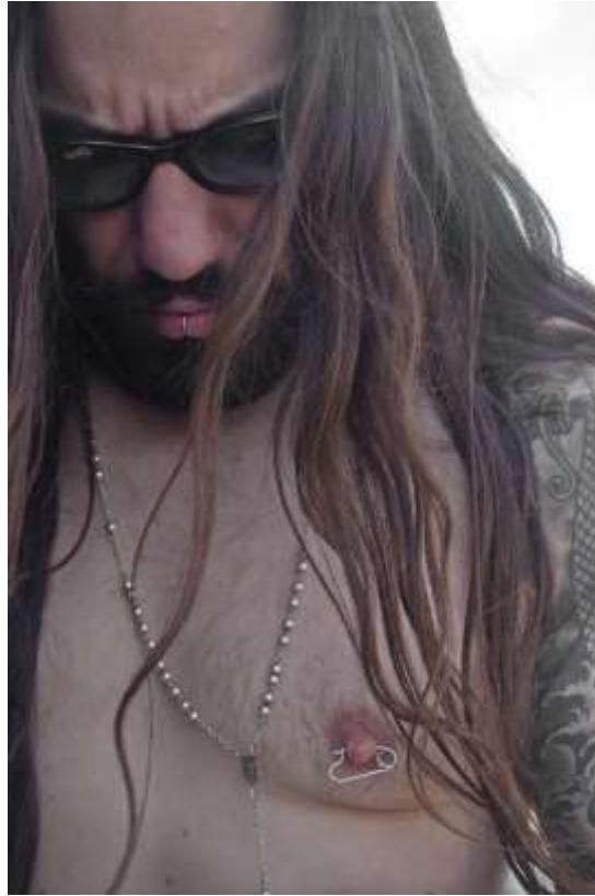
Pierced, Bare Men by Abigail Ekue Photography, 8x 12 in